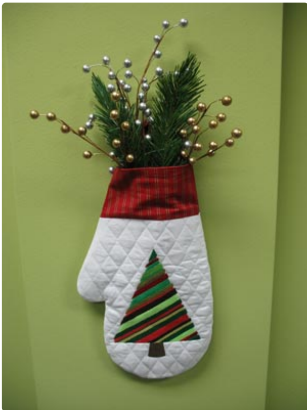
this holiday mitten decor ...