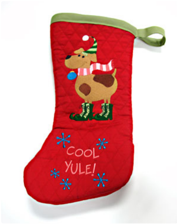
this merry stocking-shaped oven mitt ...