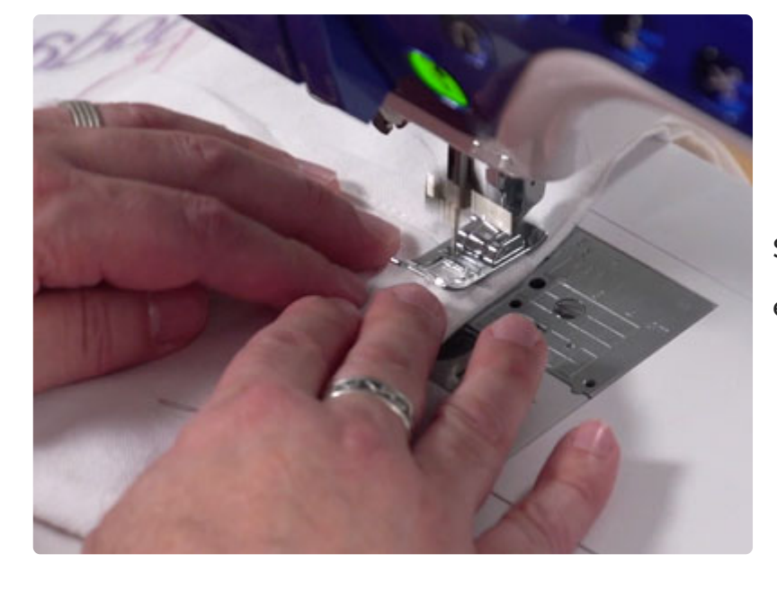
Sew a 1/2" seam along the side edges.

Pin the layers together along the side edges.