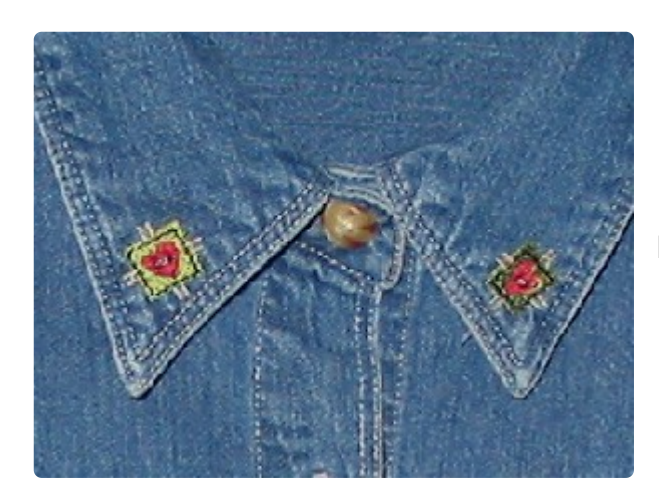
Repeat for the other collar tip.